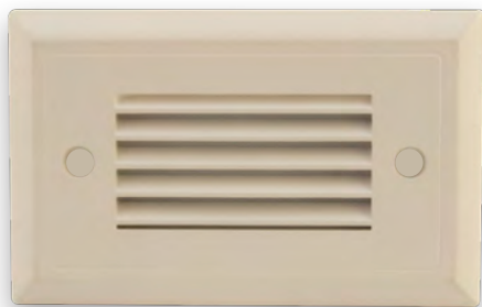
Horizontal Louvered - White - DI-MAT2-HL-WH