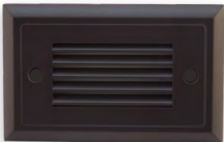
Horizontal Louvered - Bronze - DI-MAT2-HL-BZ